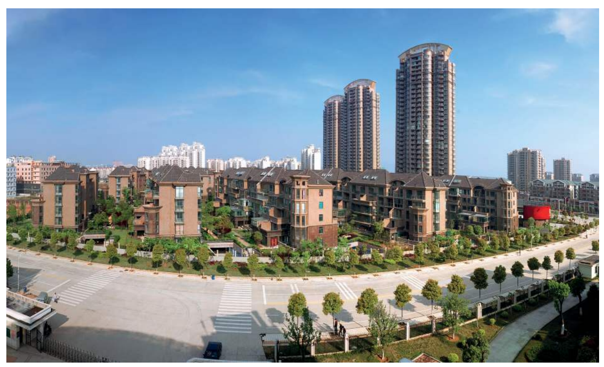
Fig. 4.2 for Question 4